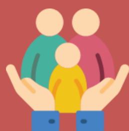
Commissions for women, family and demographic policy